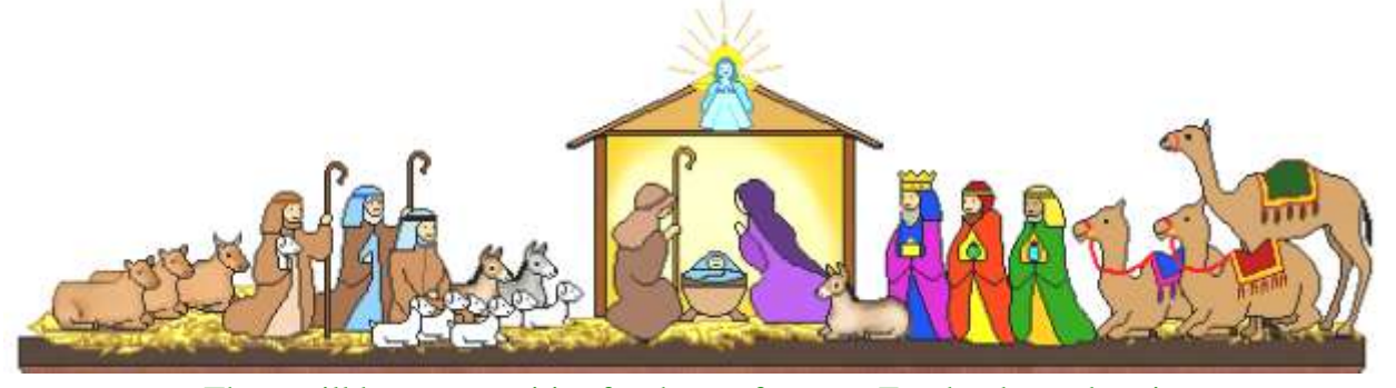
There will be opportunities for those of you on Facebook to advertise COME TO THE STABLE.

Beginning on November 8 , we will be enlisting food shoppers, bakers and food preparers, men to setup and strike sets, do traffic control and ladies to help in the kitchen during the event.