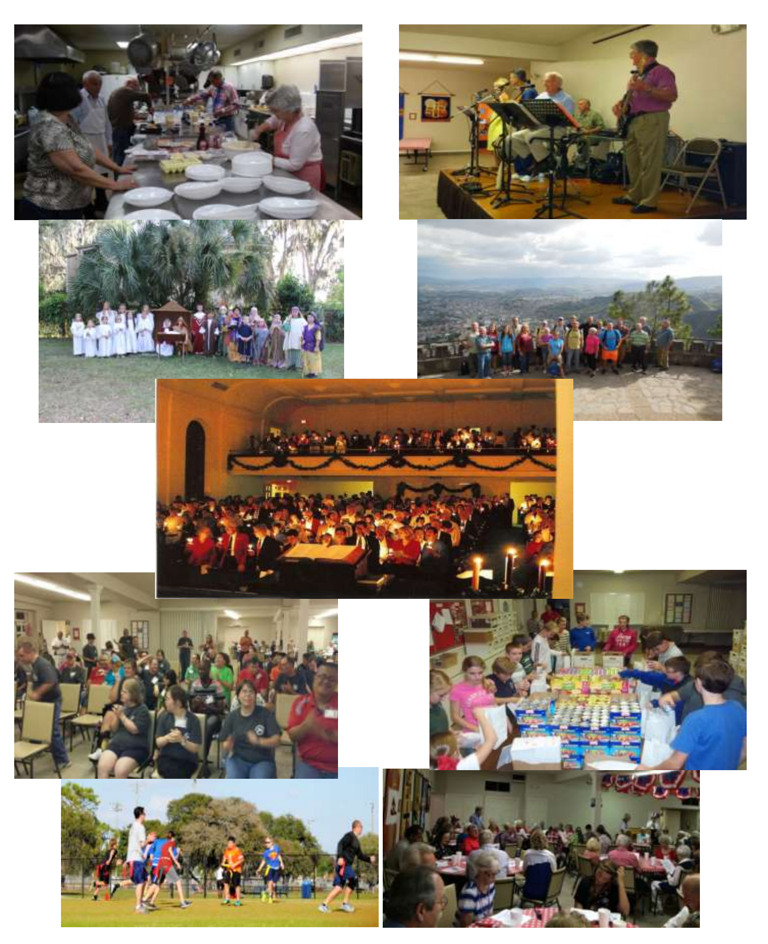
As we connect here at First Presbyterian Church of Winter Haven with other disciples of Jesus Christ, we are making FIRST PRES our FIRST CHOICE for our spiritual home.