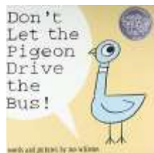
Don't Let the Pigeon Drive the Bus! Words and pictures by Mo Willems ISBN: 978-0786819881